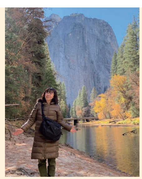
Overwhelmed with the beauty and magnificence of the nature of Yosemite National Park ヨセミテ国立公園の自然の美しさと雄大さに圧倒される

授業研究は明治時代に日本で始まった教育手法で、 教師が他の教師の授業を研究し自らの教授法に活 かすというものだ。アメリカで広まったのは、アメ リカの学者が約20年前に日本の授業研究を著書 で紹介したのがはじまりだ。日本では一般的だが、